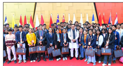
Rising Rajasthan Summit

In MSME Conclave at Rising Rajasthan Summit held at JECC Sitapura, on December 11, 2024, the students got the opportunity to interact with Chief Minister Sh. Bhajan Lal and other dignitaries. They also visited the exhibition and came to know about the advancements in AI and other fields. The event was graced by Deputy CM Diya Kumari and Col. Rajyavardhan Rathore.