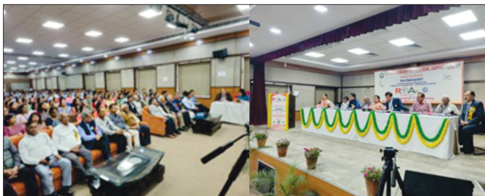
National Conference "Viksit Bharat@2047"