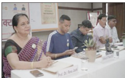
Youth Leadership Programme