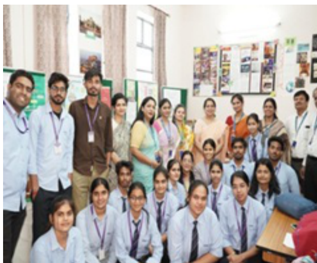
World Heritage Day