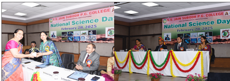
National Science Day 2025