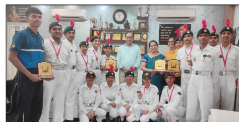
Winner NCC Cadet in ATC Camp 2025

Gold Medal: - Best Cadet, Firing, Test, Tug of War, Relay Race, Race Silver Medal: Rifle String & Assembling, Drill Individual, PPT.