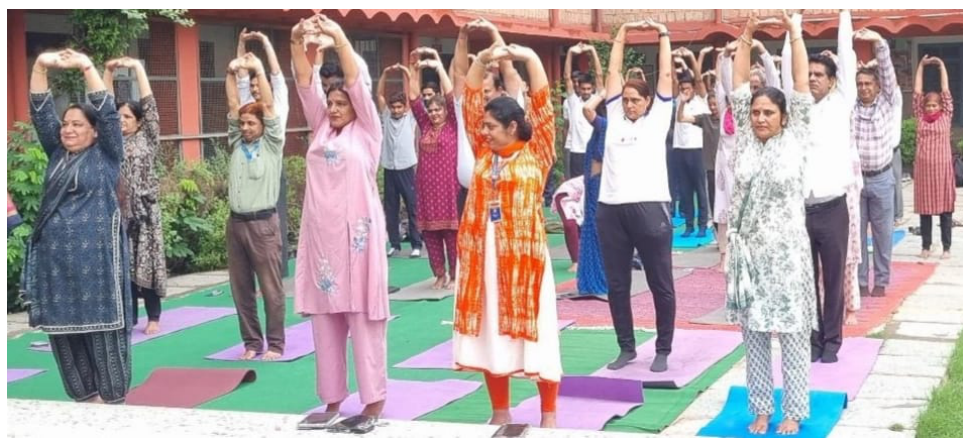
International Yoga Day Celebration

The Dept. of Microbiology organized Extempore and Debate Competitions for both UG and PG students on Feb. 24 2025. The participants showcased their critical thinking, and impressive oratory skills highlighting the importance of such events in academic development.