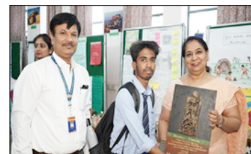
Heritage Day Celebration

The Indian Culture and Heritage Club of the Department of History observed a vibrant and insightful Heritage Day Celebration on April 21, 2025 aimed at highlighting the rich cultural tapestry of India. The event included project-making and poster-designing competitions, offering a creative platform for students to explore and express their understanding of India's diverse heritage.