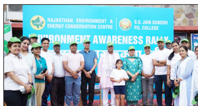
Plastic Pollution Free Awareness Rally in environmental protection.

The college in collaboration with the Rajasthan Environment and Energy Conservation Centre, organized the following. Activities on World Environment Day June 3, 2025: