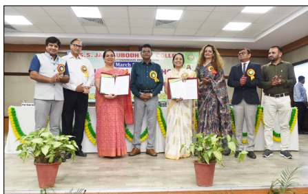
National Workshop on IPR