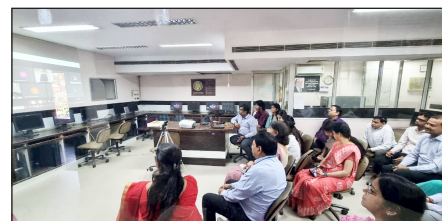
FDP with NITTTR

Dept. of Computer Science organized a 5 Days Online FDP on "AI and Cloud based Tools for Research" in collaboration with National Institute of Technical Teachers Training & Research, Chandigarh Ministry of Education, Government of India from March 24-28, 2025.